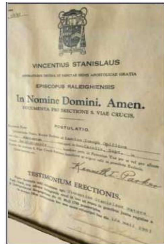
Officially Blessed May 12th, 1963